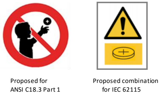
Fig. 1 – Examples of Graphical Warnings