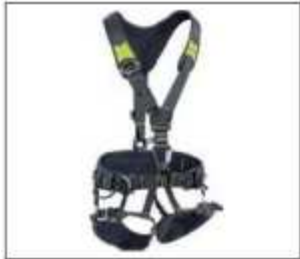
Core Plus CL (88058)