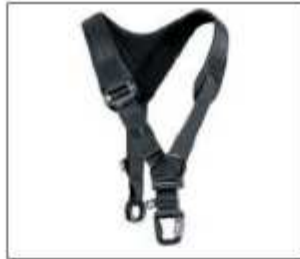
Core Top (88041)