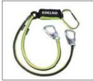
Belay Kit (76014 / 76015)