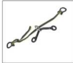
Core Sliding D-Kit (88052)

In order to ensure transparency and unambiguous identification on the market, the bolts in unused products or products still in their original packaging must also be replaced.