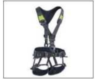
Core Plus (88057)