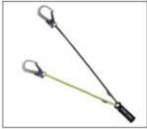
Scope (88116 / 88117)