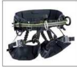
Tree Core (88050)