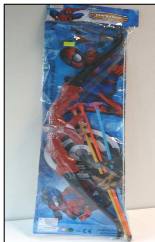
2 ▲ "MARKSMAN BOW AND ARROW TOY GAME SERIES"

Description: Plastic bow and three arrows set. Item No. R666.