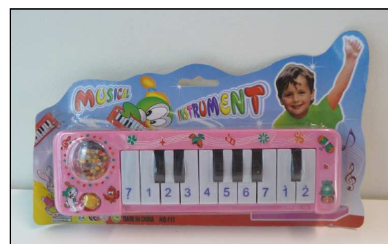
7 ▲ "MUSICAL INSTRUMENT" KEYBOARD SET

Description: Plastic musical keyboard set. Item No. 111.