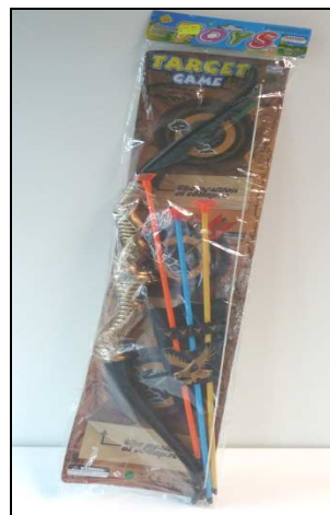
3 ▲ "TOYS TARGET GAME" BOW AND ARROW SET

Description: Plastic bow and three arrows set.