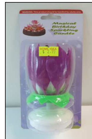
▲ 8 "MUSICAL BIRTHDAY SPARKLING CANDLE"

Description: Plastic gun and projectiles set. Item No. 129-7.