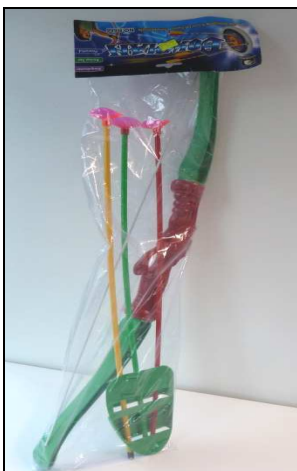
1 ▲ "BOWMAN" BOW AND ARROW SET

CONTACT DETAILS: You can contact HOME IDEAS PRODUCTS by telephoning (03) 9311 5571, Monday to Friday between 9:00 am and 5:00 pm. HOME IDEAS PRODUCTS is located at Shop 48, Sunshine Market Place SC, Sunshine Victoria 3020.