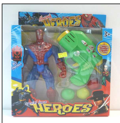
5 and 6 ▲ "STRONG HEROES" and "SPECIAL FORCE HEROES"

Description: Candle set in a green, red and white plastic holder. Item No. GK-1 Candle 1.