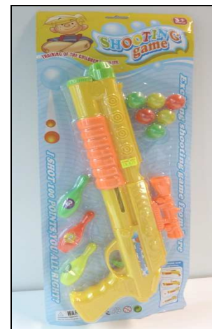
4 ▲ "SHOOTING GAME"

Description: Plastic bow and three arrows set.