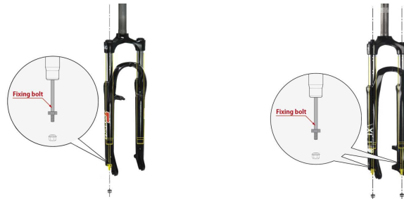
Single fixing bolt version (Right Side Only)