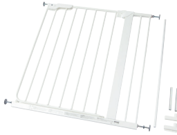
PATRULL KLÄMMA safety gate (Article No. 702.265.24)