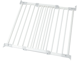
PATRULL FAST safety gate (Article No. 902.265.18)