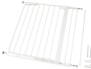
PATRULL KLÄMMA safety gate (Article No. 702.265.24)