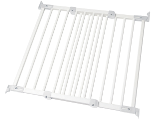
PATRULL FAST safety gate (Article No. 902.265.18)