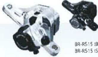
BR-R515 (Black) BR-R515 (Silver)