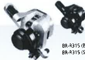
BR-R315 (Black) BR-R315 (Silver)