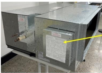
PCB LOCATED INSIDE ELECTRICAL BOX