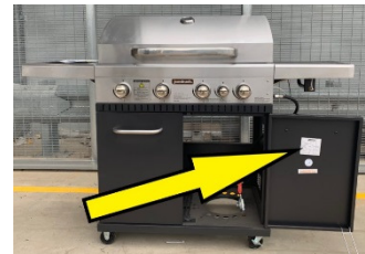
Location of data label