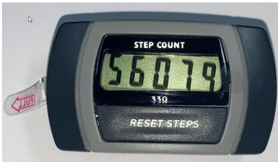
REGENT 330 STEP PEDOMETER

Regent Sporting Goods (Aust.) values product safety and quality and wishes to notify consumers of a product recall of below products: