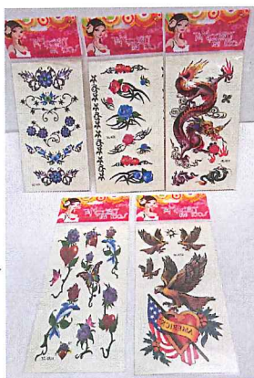
1 ▲ "TEMPORARY TATTOOS"

CONTACT DETAILS: You can contact WENS BROS TRADING PTY LTD by telephoning (03) 9543 5398, Monday to Friday between 9:00 am and 5:00 pm. WENS BROS TRADING PTY LTD is located at 15 Winterton Road, Clayton VIC 3168.