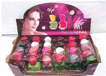
2 ▲ "NAIL POLISH PEELABLE"

Description: Assorted tattoos. Item No. SL-34, SL-23, SL-24, SL-21, SL-33.