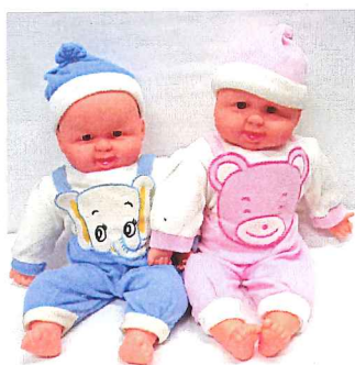
5 ▲ SOFT TOY DOLLS (LARGE)

Description: White mouse and Black mouse