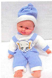
6 ▲ SOFT TOY DOLLS (SMALL)

Description: Pink and blue battery operated dolls