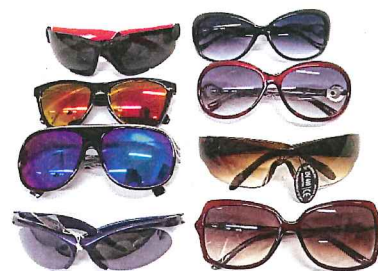
7 ▲ SUNGLASSES

Description: Assorted sunglasses. Item No. 3-15, 5-15, 3131, 2081, T-96, 217, 8861, 12027