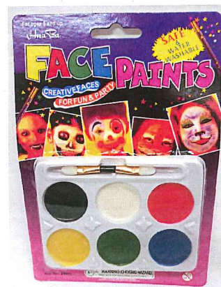
3 ▲ "FACE PAINTS"

Description: Assorted coloured nail polish Item No. 34181