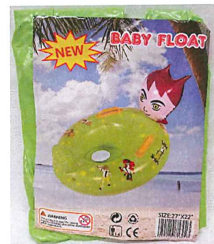
8 ▲ "BABY FLOAT" BEN 10

Description: Assorted sunglasses. Item No. 3-15, 5-15, 3131, 2081, T-96, 217, 8861, 12027