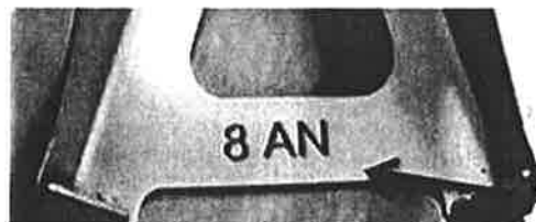
DATE CODE LOCATION (INSIDE LEG)